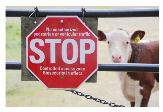
Beef steer looks through a gate with a biosecurity stop sign on it.

jobs related to the food and animal agriculture industry in Michigan<sup>2</sup>