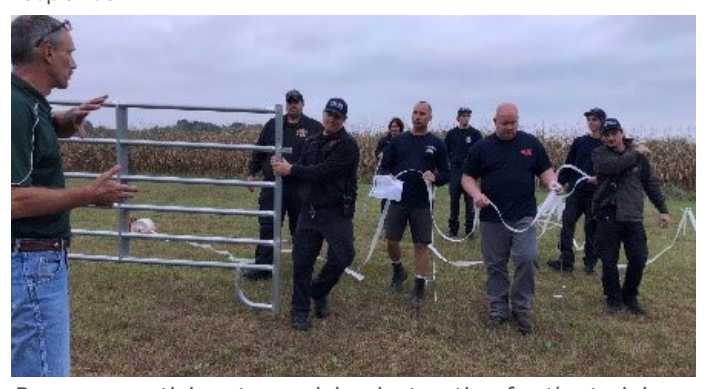
Program participants receiving instruction for the training activity in Jackson County.

A key goal of the ERAIL project is to provide first responders across the state with access to the tools and equipment needed to properly respond to an accident involving livestock. ERAIL response trailers are cargo trailers fully stocked with equipment and supplies that may be needed when responding. Accidents of this type typically require specialized equipment not normally carried in first responder vehicles. By locating these trailers in areas of the state that typically see high levels of animal movement and are close to major highways, those responding to accidents are better able to access the type of equipment needed to make an effective and efficient response.