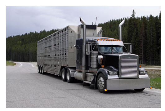
Livestock hauler moves down the road.